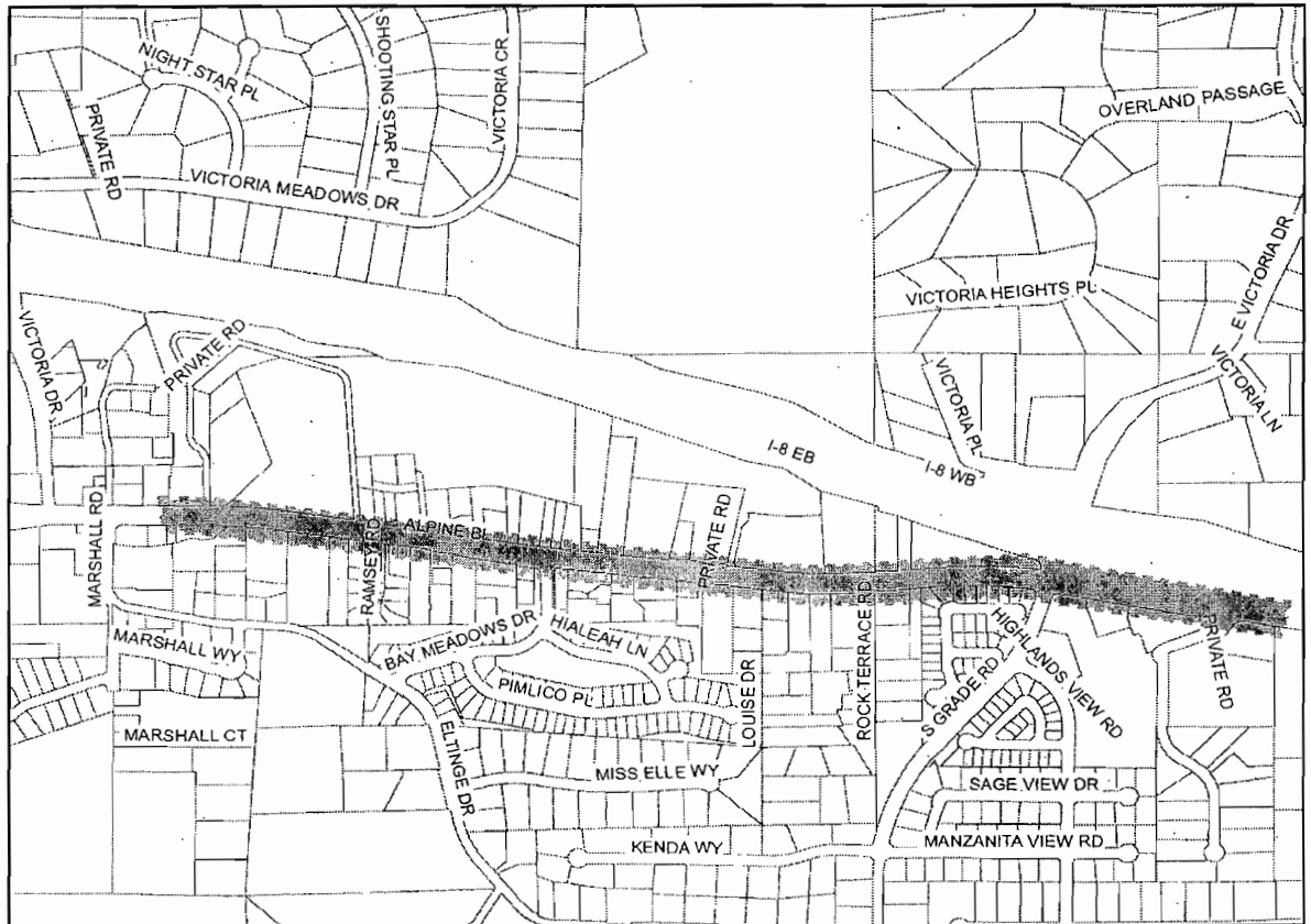
Underground Utility District No. 111 Alpine Blvd (From 270' East of Marshall Road to 975' East of South Grade Road)